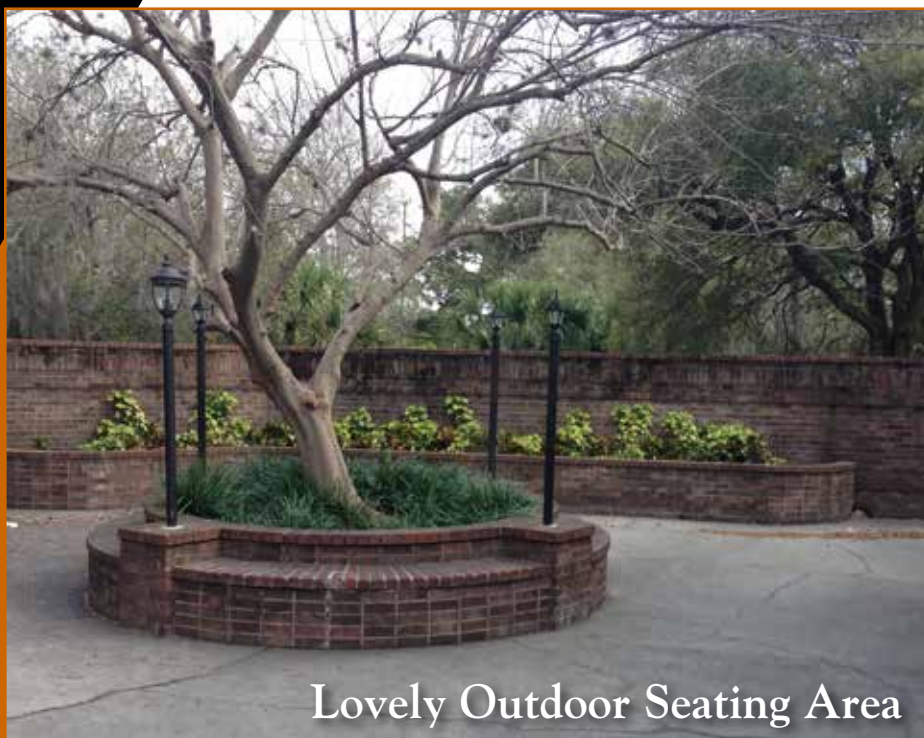
Lovely Outdoor Seating Area